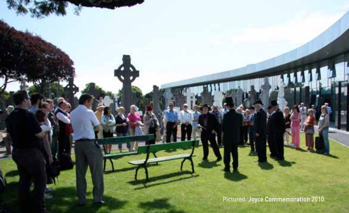
Pictured. Joyce Commemoration 2010.