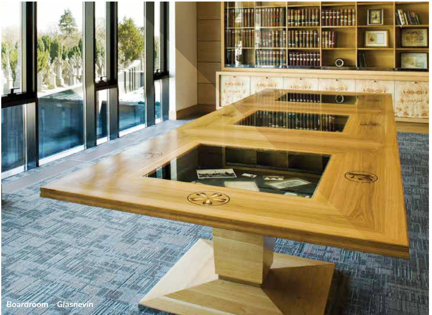
Boardroom – Glasnevin

The Committee are responsible for keeping proper books of accounts which disclose with reasonable accuracy at any time the financial position of The Dublin Cemeteries Committee. The Committee members are also responsible for safeguarding the assets, and hence for taking reasonable steps for the prevention and detection of fraud and other irregularities. The Committee are responsible for the maintenance and integrity of the corporate and financial information included on the Committee's website.