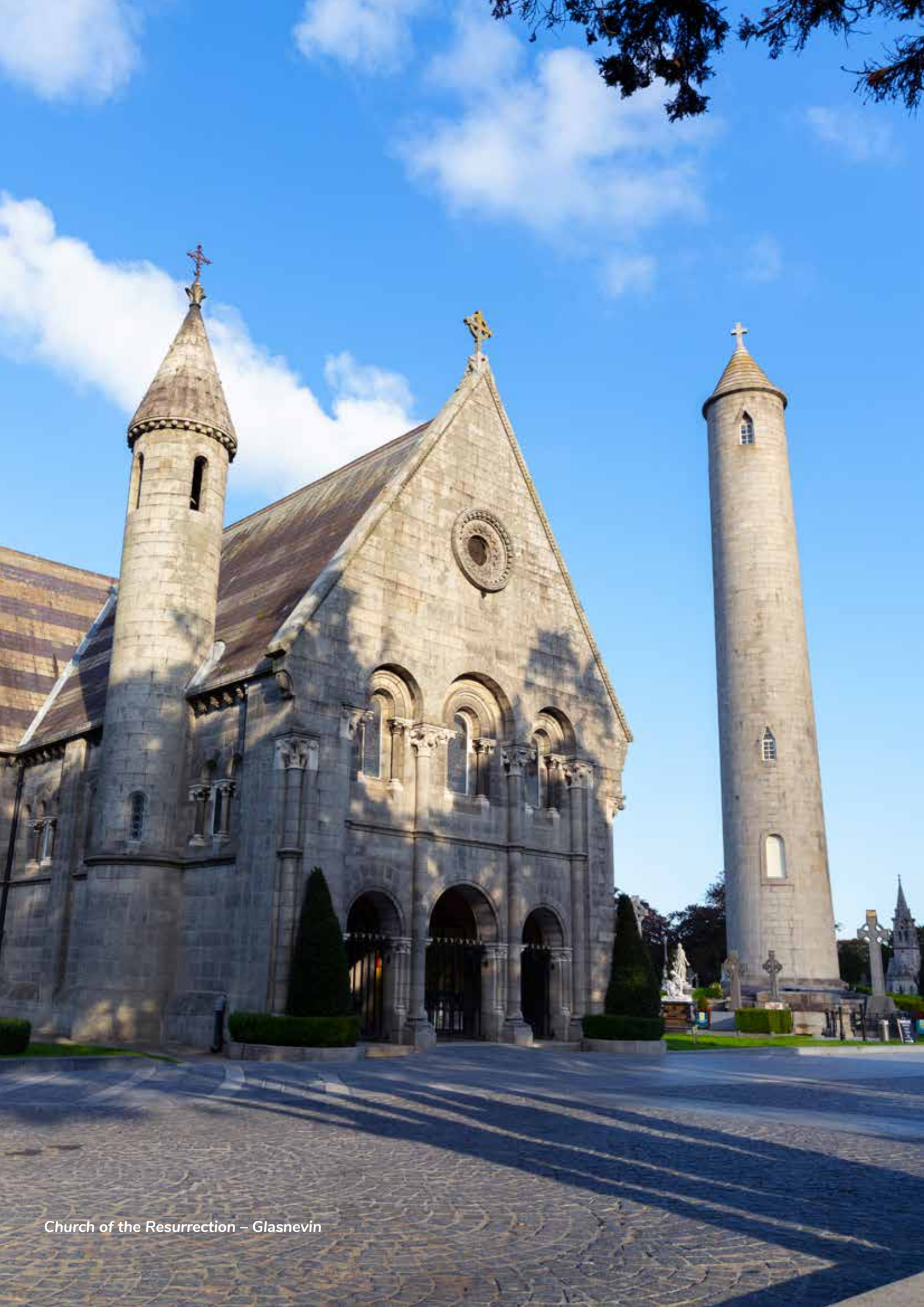
Church of the Resurrection – Glasnevin