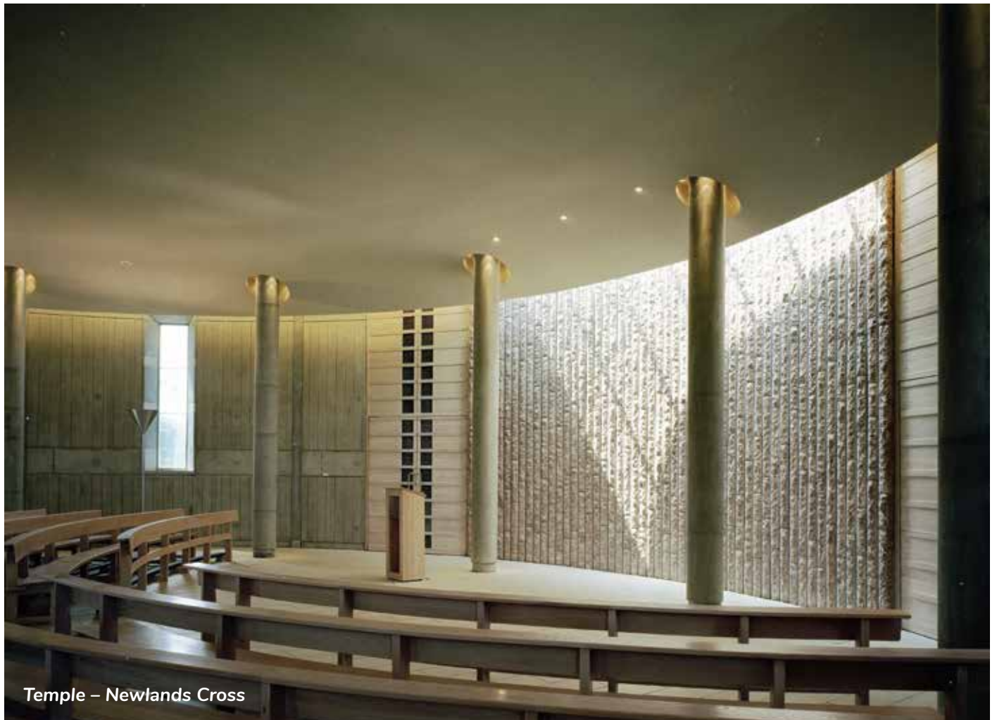
Temple – Newlands Cross