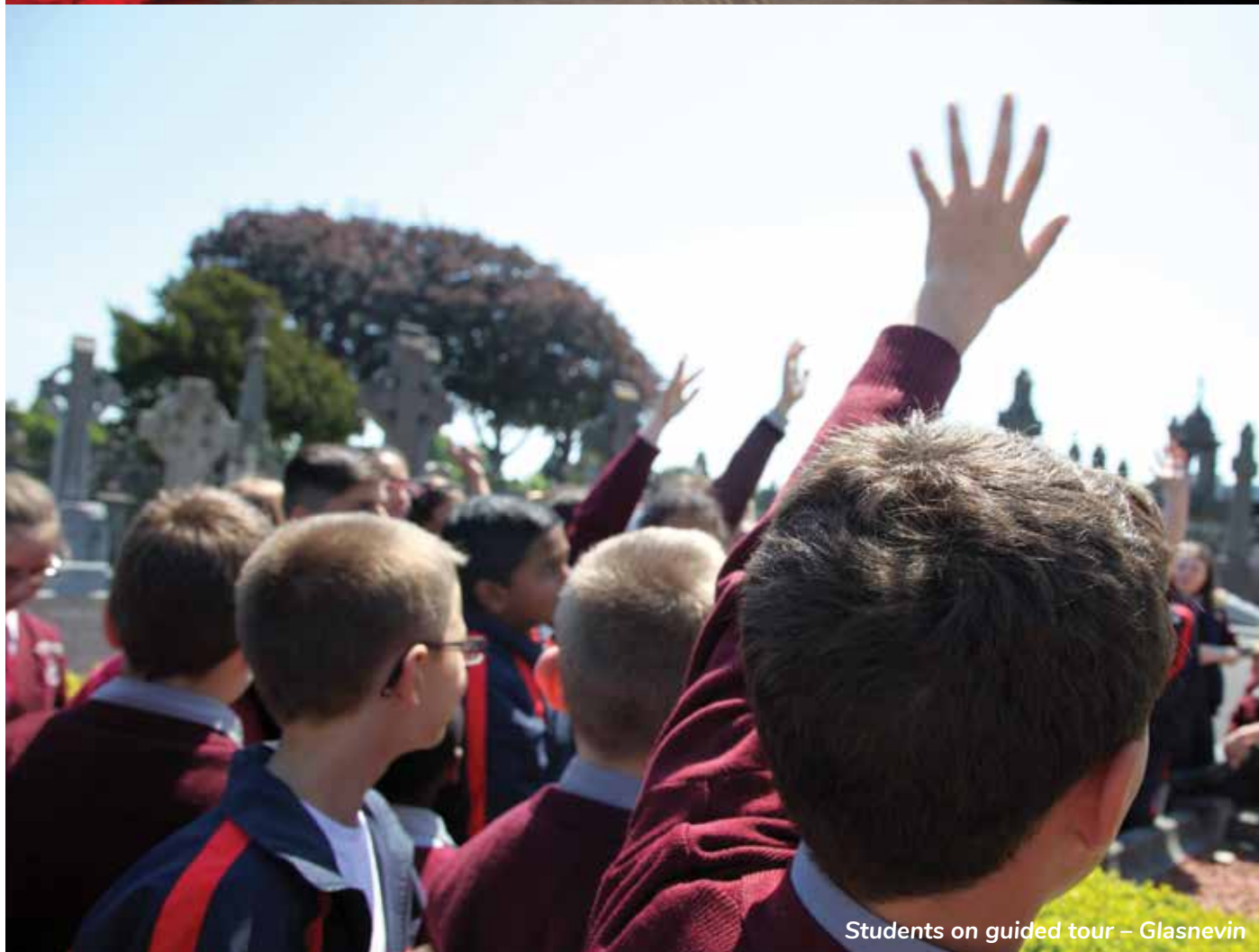
Students on guided tour - Glasnevin