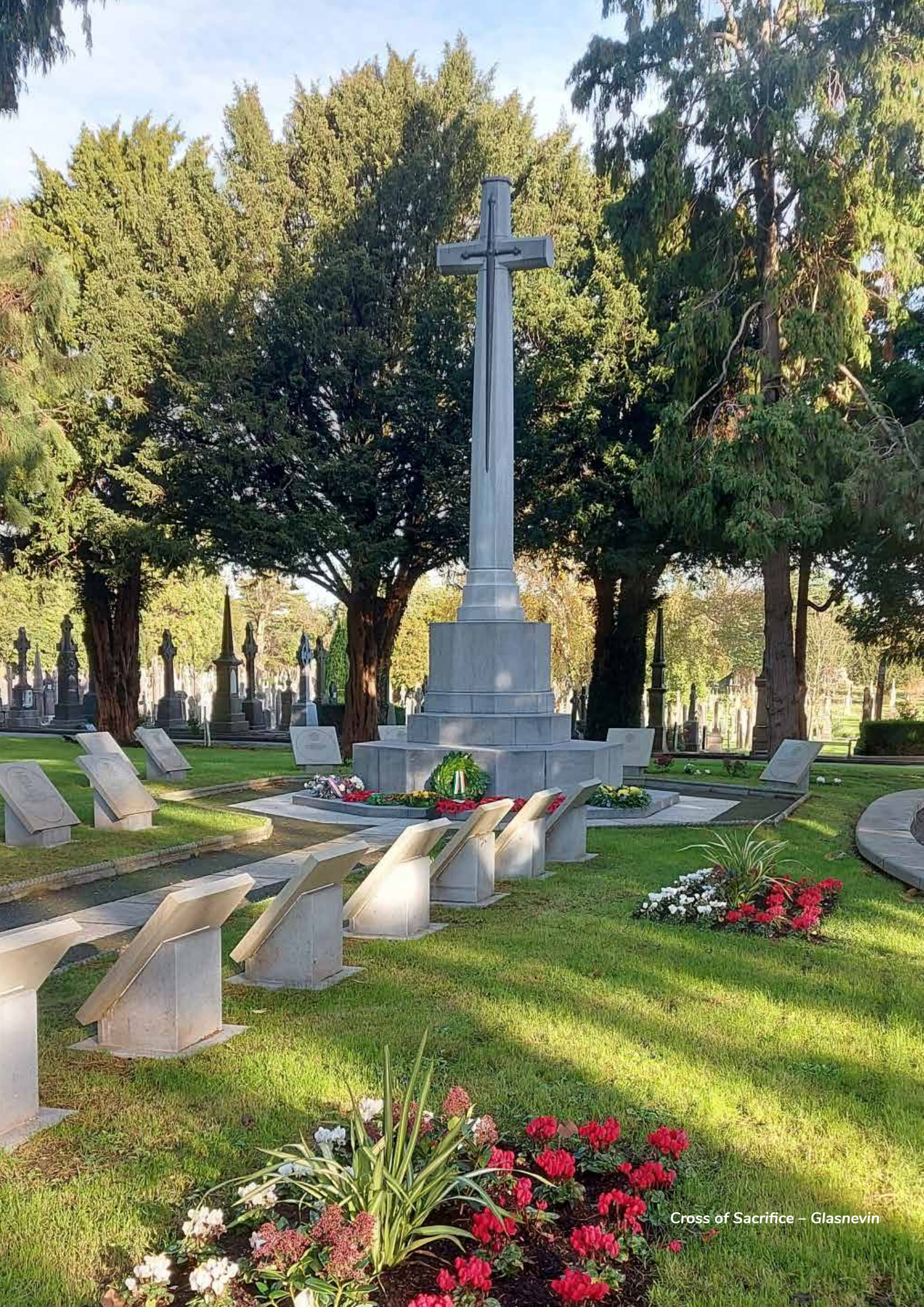
Cross of Sacrifice – Glasnevin