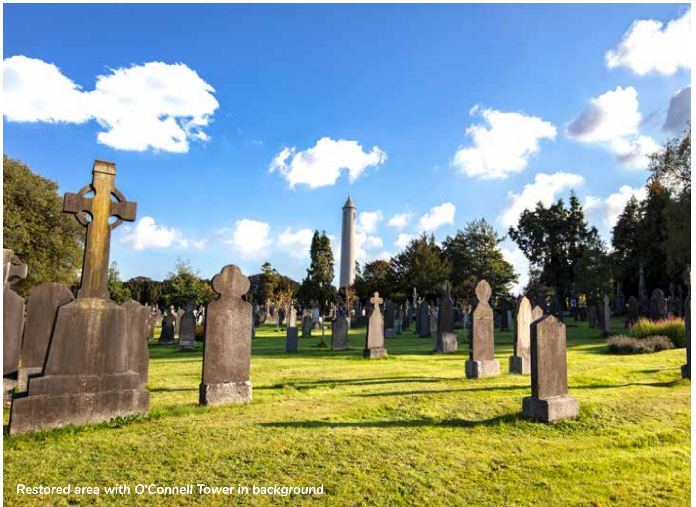
Restored area with O'Connell Tower in background

To support the executive team, there is a layer of management across functional areas and sites. Each site/service has a local management team responsible for the day to day management of these services with robust reporting structures in place. There are also specialist managers to support the full organisation in the areas of Human Resources and IT.