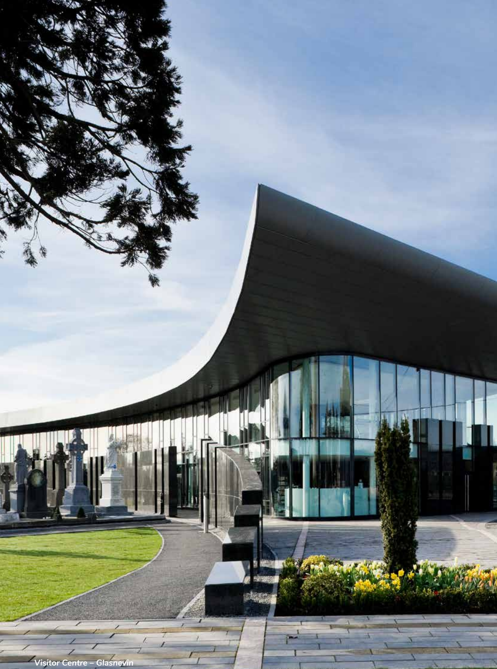
Visitor Centre – Glasnevin